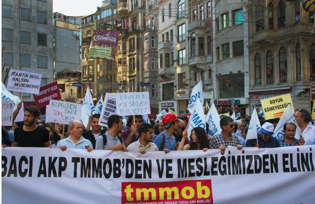
Delivering a message. Turkish engineers and architects assemble on 13 July for march on Taksim Square.