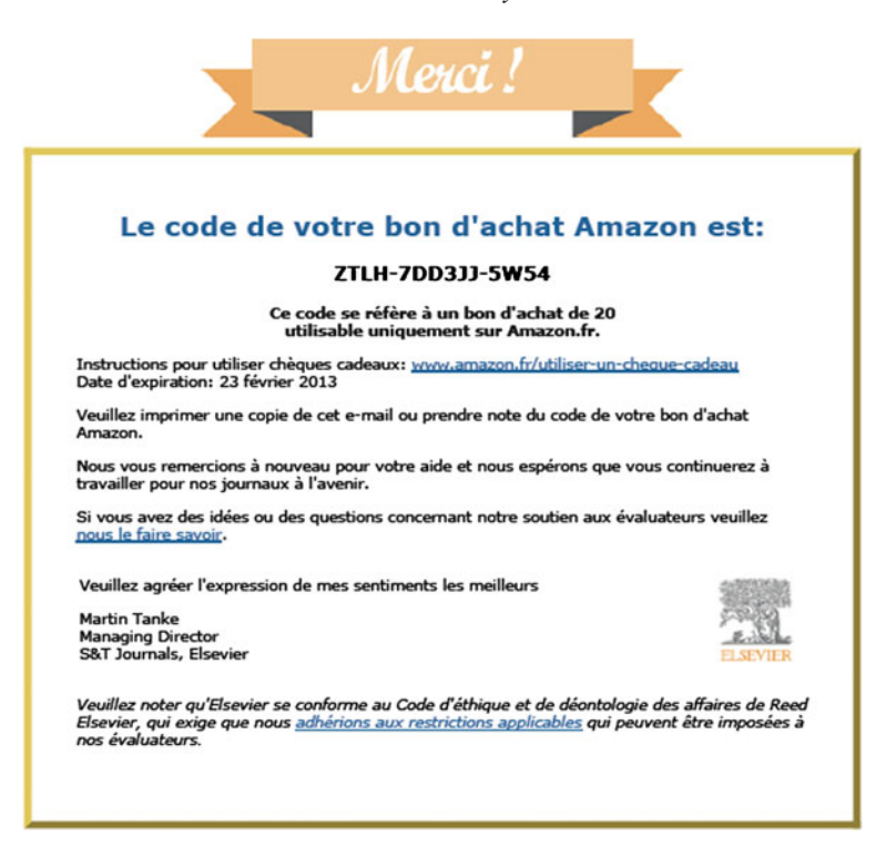
Figure 1. A generous present received in recognition for writing referee reports: a voucher for €20.